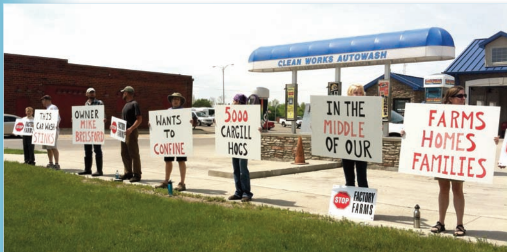
Demonstrators opposing a Dallas County CAFO picketed in front of the owner's car wash.